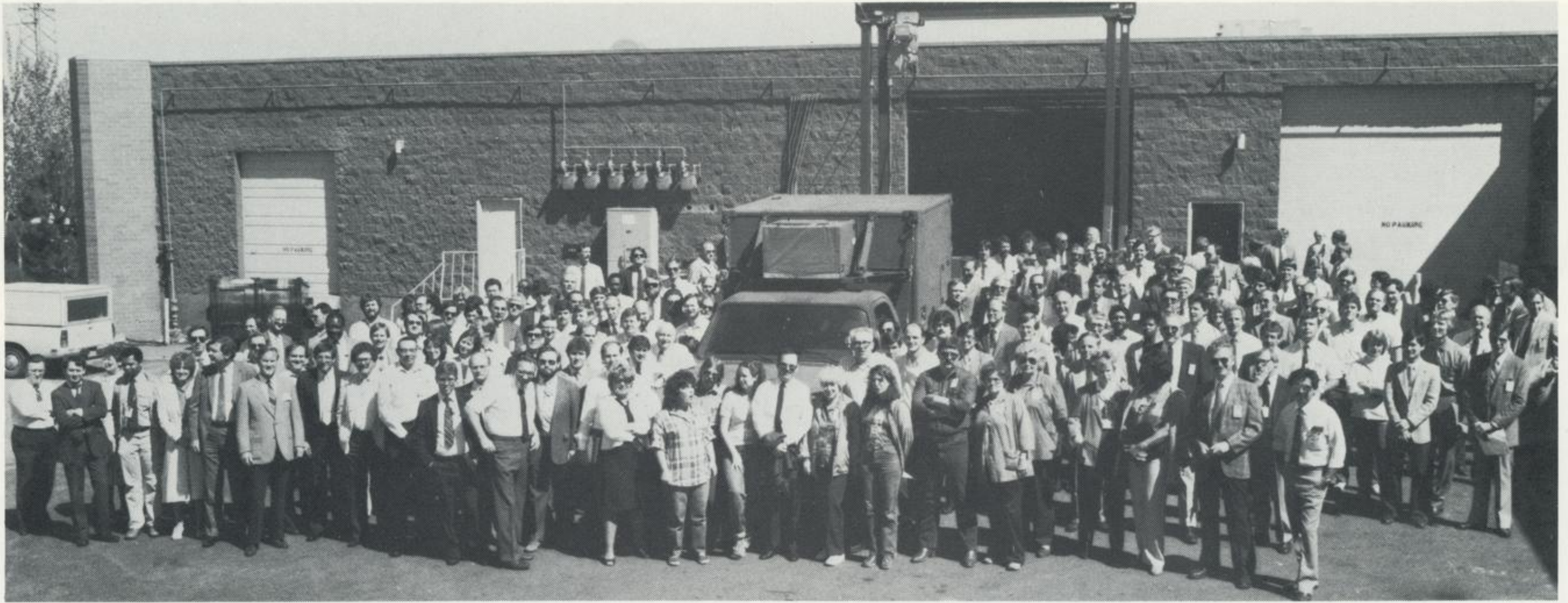
More than 250 employees on the ASAS/ENSCE program surround the shelter after its rollout on April 29.