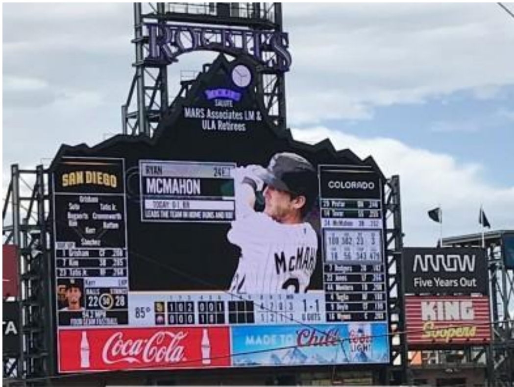
MARS Rockies Picnic & Game Aug 2, 2023 Scoreboard Salute