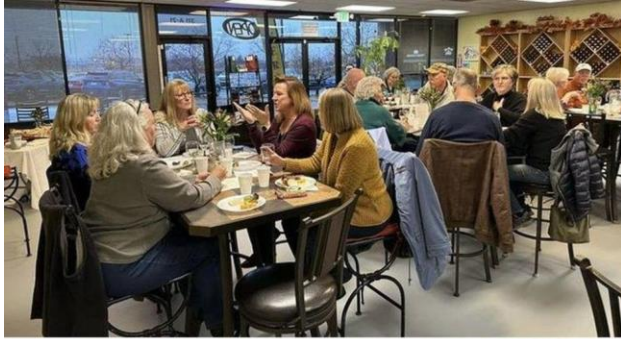
Wine Tasting at Water2Wine, Nov 8, 2023 MARS Group shares some wine & snacks