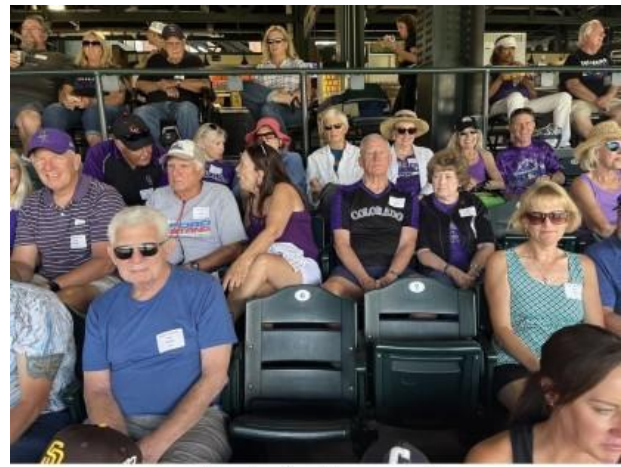
Ready for the game!