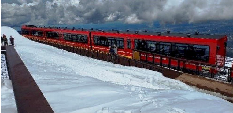
At the Top of Pikes Peak - Our Train