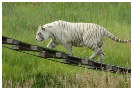
White Tiger Climbing Ramp to Platform