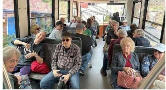
Manitou Pikes Peak Rail Car #1 MARS Group-Front of Car