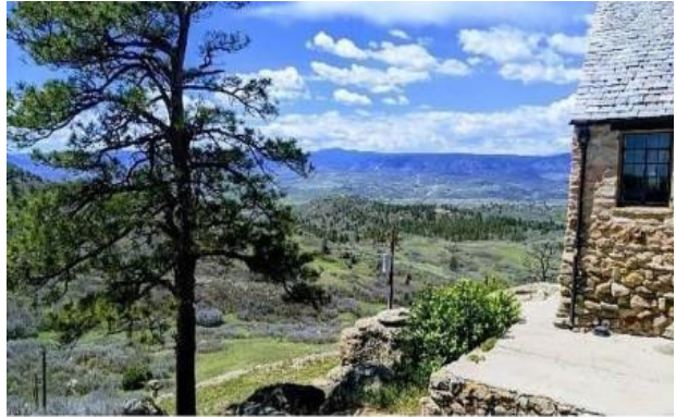
South Patio View