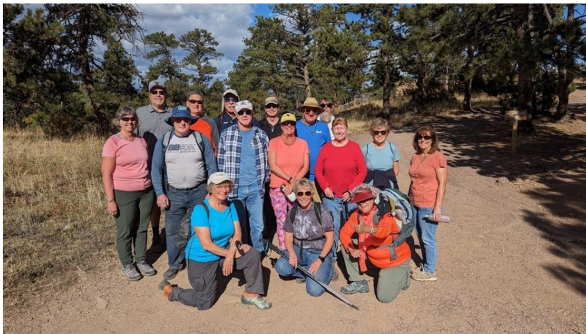
October hike in Mount Falcon Open Space