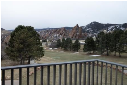
Arrowhead Golf Course View