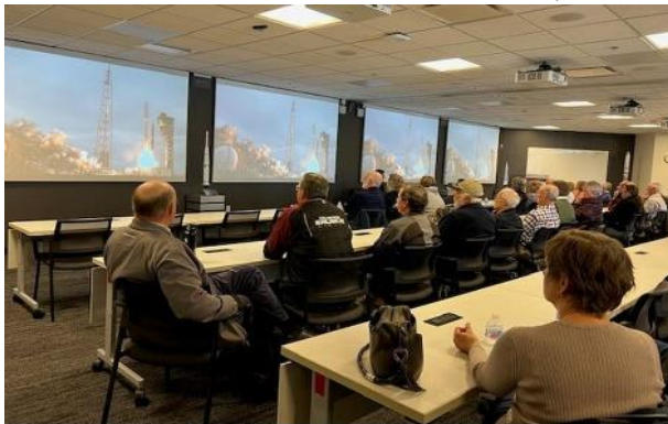
ULA Tour, March 2023