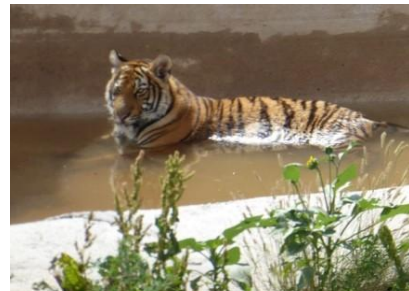
Tiger taking a Cool Bath