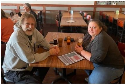
Lunch After ULA Tour, March 2023