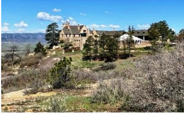
View of Cherokee Castle