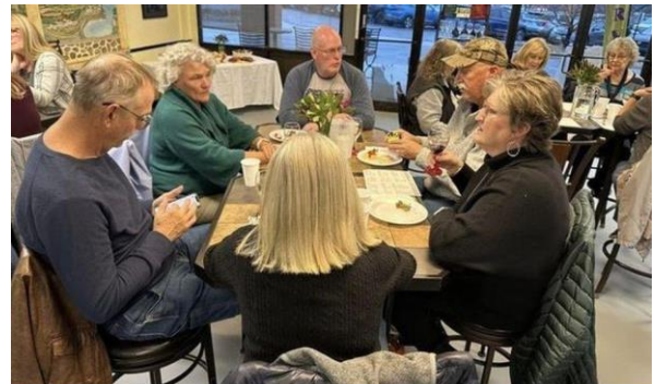
Wine Tasting at Water2Wine, Nov 8, 2023 Sharing some Wine & Snacks