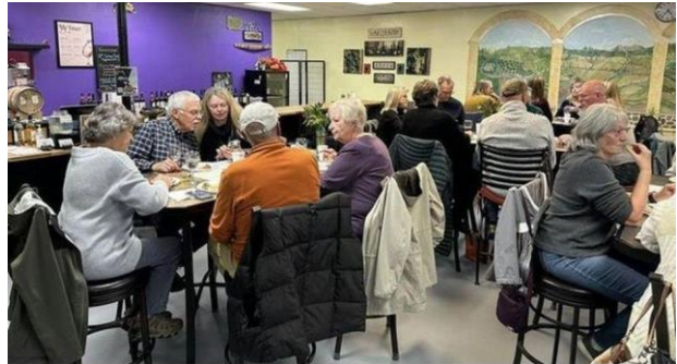
Wine Tasting at Water2Wine, Nov 8, 2023 Sharing some Wine & Snacks