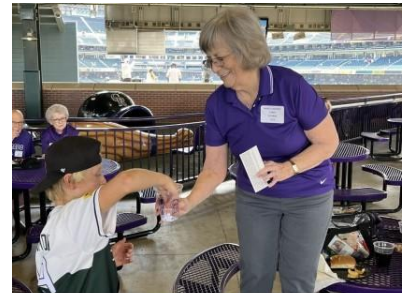
Drawing Names for Free Game Tickets