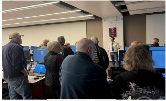
ULA Tour, March 2023