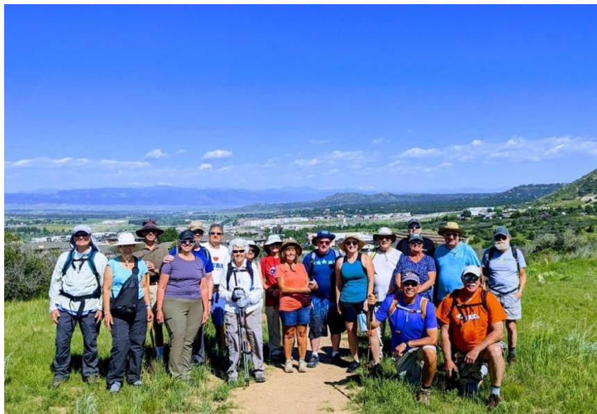
June hike in Metzler Family Open Space