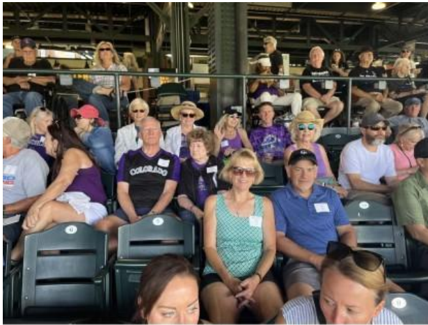
Ready for the game!