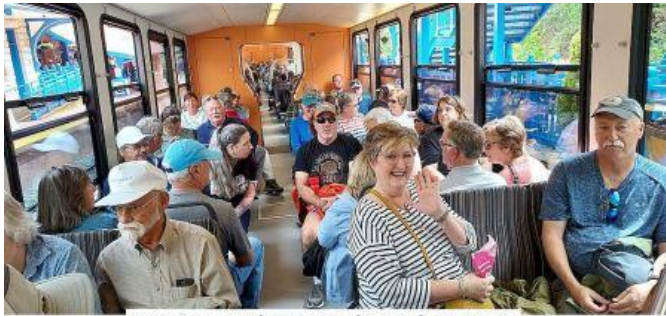
Manitou Pikes Peak Rail Car #1 MARS Group-Back of Car