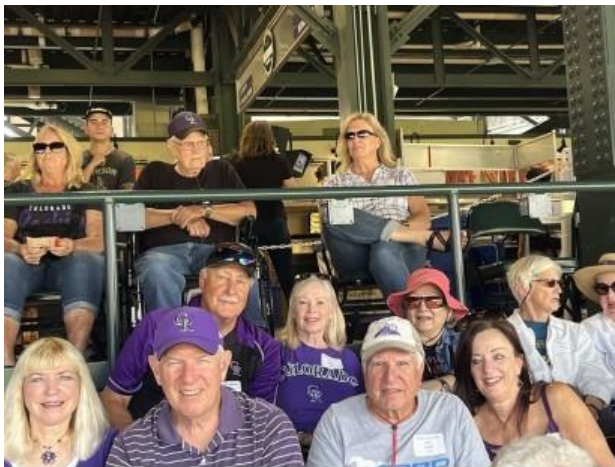
Ready for the game!