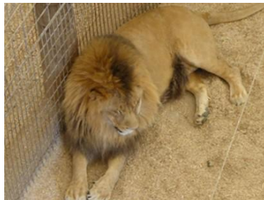
Male Lion in Barn