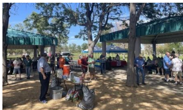
Picnic Pavilions at Clement Park