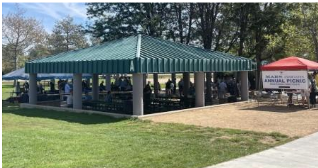
Picnic Pavilion and Check-in Table at Clement Park