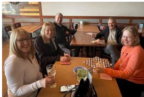
Lunch After ULA Tour, March 2023