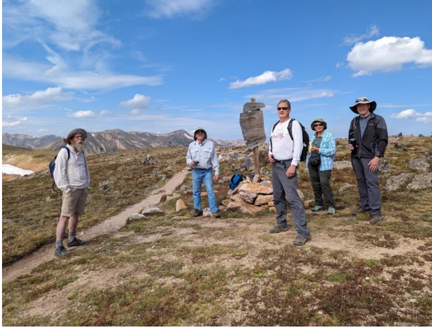
August hike Continental Divide Trail above Berthoud Pass