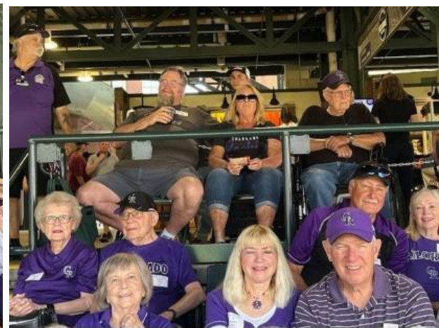
Ready for the game!