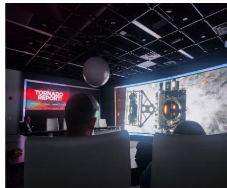
Pulsar Lab Demonstration