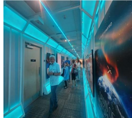
Entrance to Pulsar Lab