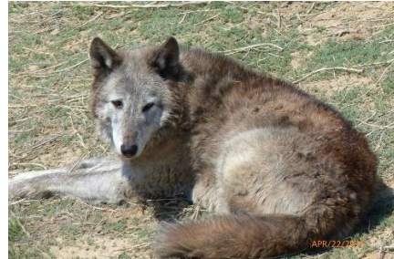
Wildlife Sanctuary Wolf