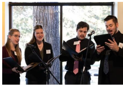
Colorado Christian College Choir