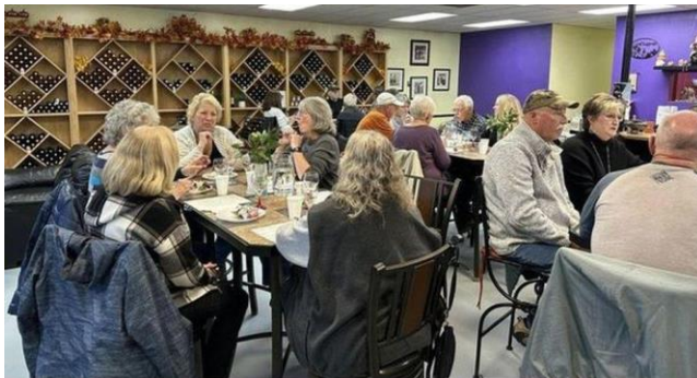
Wine Tasting at Water2Wine, Nov 8, 2023 Sharing some Wine & Snacks