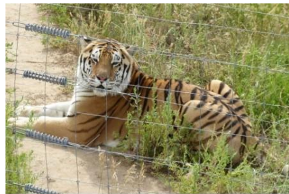
Tiger Resting, Waiting to be Fed