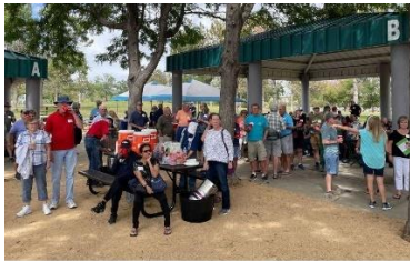
Onlookers During Raffle