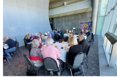
Enjoying the breakfast!