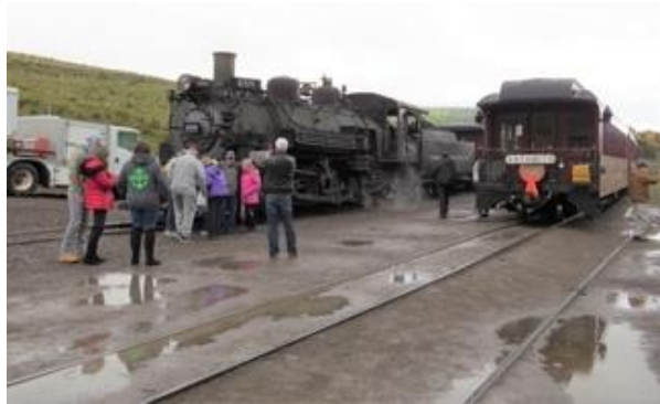
Inspecting the Train