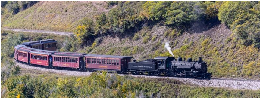
Train Going Up Cumbres Pass