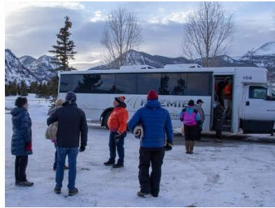
The Bus Arrives