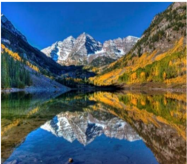
October 2022 – First Place Maroon Lake by Tom Frickell

Several selected photography club winners are presented below. Remember that all the winning images are shown on the MARS club web site for the year of 2022. You are encouraged to view these and more images online.