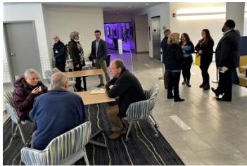
Refreshment area, Engineering Bldg. View 1