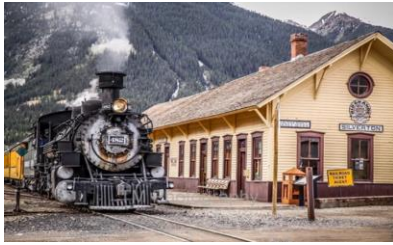
Durango Train & Station