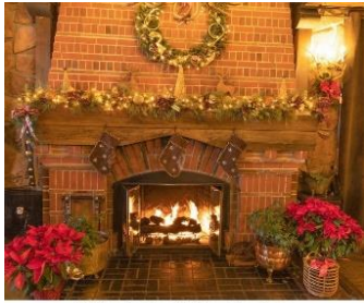
Welshire Inn Holiday Fireplace