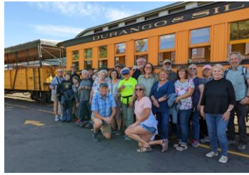
27 Brave Souls