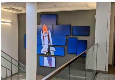
Atrium Video Display