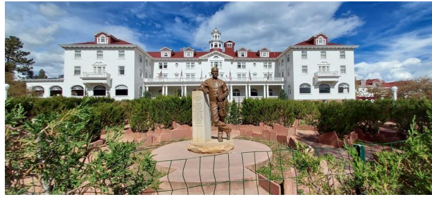
Famous Stanley Hotel