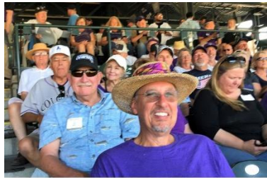
Waiting for First Pitch!