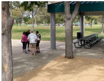
End of Picnic Stragglers