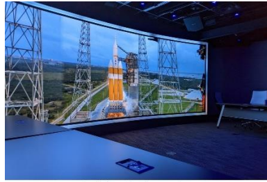
2nd Floor Conference Room View 3, (Credit: S Petty)