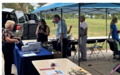
Checking out the vendors