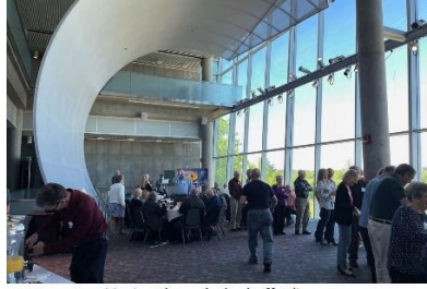
Moving through the buffet line