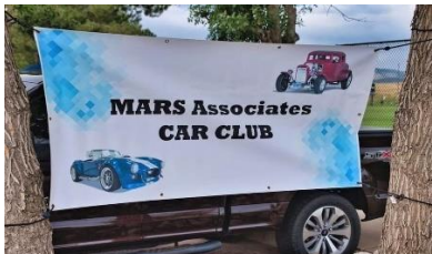
MARS 2022 Car Show at the Picnic