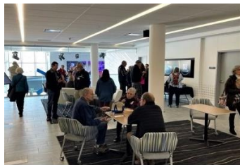
Refreshment area, Engineering Bldg. View 2