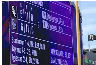
Rockies Win 6-5!!