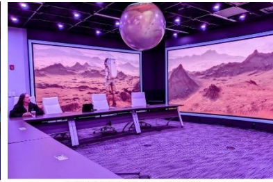
Pulsar Center, Engineering Bldg. View 1