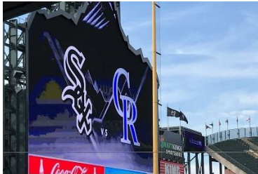
MARS at the Rockies 2022 Chicago White Sox vs Colorado Rockies