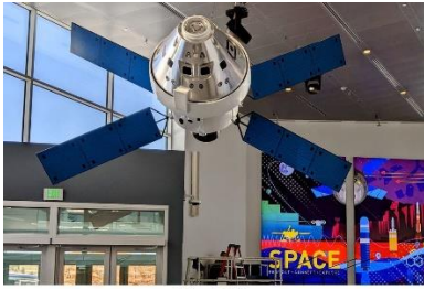
Entry Lobby