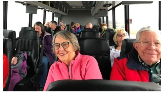
The Bus Ride Home