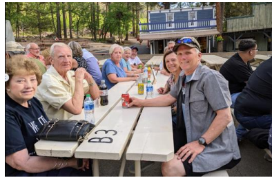
Bar D Chuckwagon Dinner