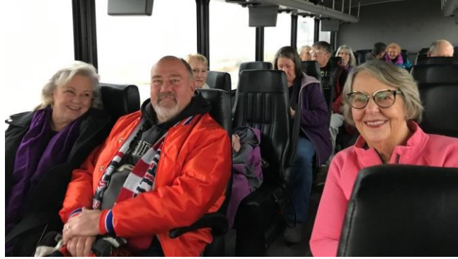
On Bus to Breckenridge