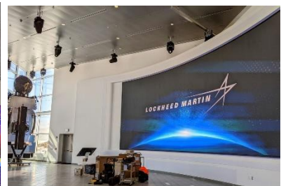
Entry Lobby, View 2