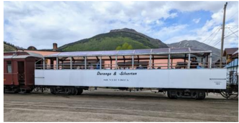
Open Photo Car