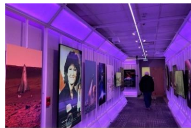
2nd Floor Hallway, View 2