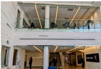
Entry Lobby, View 3