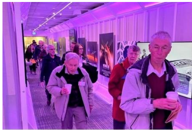
2nd Floor Hallway, View 1