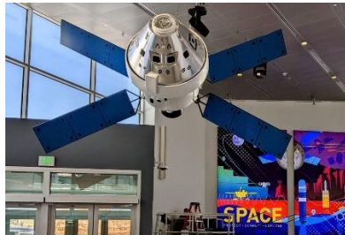
Entry Lobby