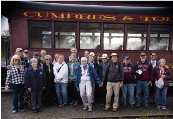
22 MARS Members Enjoyed the Ride