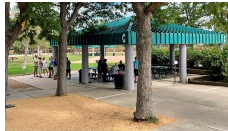
End of Picnic Stragglers