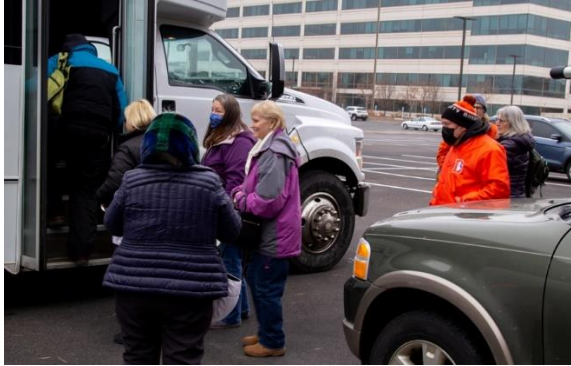
Getting Ready to Go