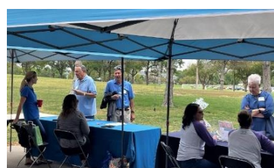
Checking out the vendors