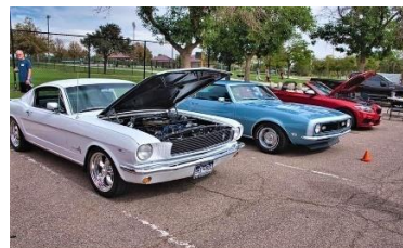
MARS 2022 Cars Exhibited