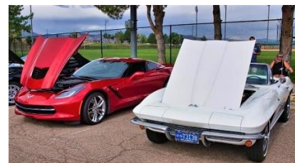
MARS 2022 - More Hot Wheels