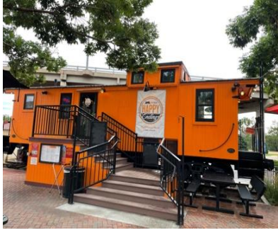
Breakfast at Happy Endings