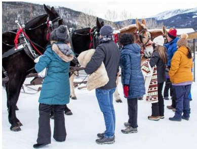
Greeting the Mules