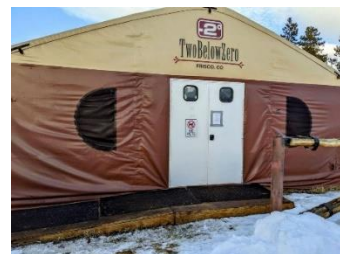
2 BELOW Dining Room