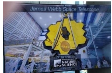
Intro to the Presentation: James Webb Space Telescope in the Test Lab