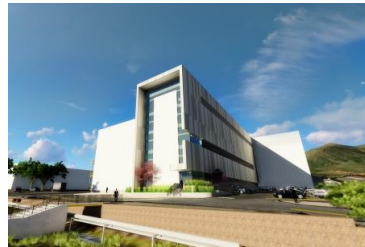
New Space Building