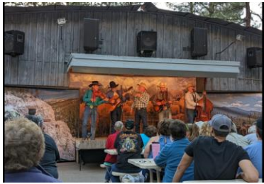
Bar D Chuckwagon Entertainment