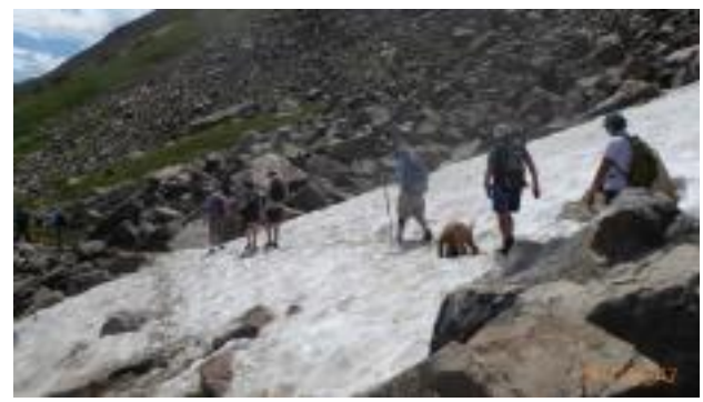
Crossing a snowfield on the Silver Dollar Lake Trail.

Gene Dionne planned the July hike to Silver Dollar Lake near Guanella Pass. Sixteen hikers and three dogs made the climb above the Guanella Pass Road to Silver Dollar Lake for excellent views of the circue to the west and several mountain peaks (including Mt. Bierstadt) to the east. After a short break many in the group continued further up to Murray Lake at almost 12,000 ft. Although it was mid-July hikers had to cross several narrow snowfields! There was a nice display of Colorado columbine to admire along the way. The weather was perfect and the temperatures cool as compared to a \sim 95 degree day in the Front Range. After working up an appetite and thirst, the hikers reconvened at "The Happy Cooker" in Georgetown for a late lunch and a round of cold beers. Good time had by all!