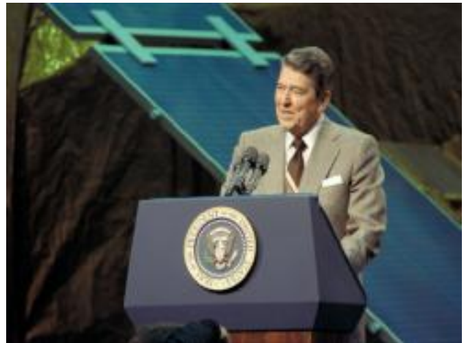
The President Speaking

On November 24, 1987, President Ronald Reagan spoke before an assembly of three thousand enthusiastic people at Martin Marietta's Waterton Plant. From landing to take off of Marine One, the entire visit lasted about two hours. The President's remarks lasted about nineteen minutes.