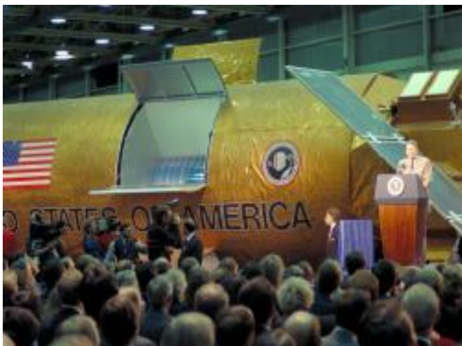
Zenith Star backdrop with President Reagan speaking

SDIs' future capability was embodied by Zenith Star. The Zenith Star experiment was designed to test the feasibility of putting a defensive laser weapon on an orbiting satellite. The model prepared for the President's visit was eighty feet long - built on the factory floor in 6 ½ days as the model was needed 'faster than posthaste'. The President was to speak in front of this model that was laid on its side to provide the backdrop the President wanted. The model was wrapped in aluminum and gold foil to present a space-like appearance.